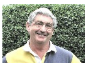
President Terry (G4CHD)

The President and newly elected and co opted Officers and Committee members are shown below :-