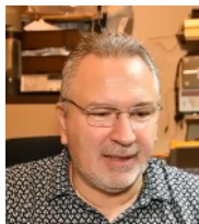
Committee Graham (M1GRA)