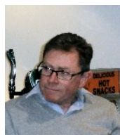
Committee Alan (2E0EUZ)