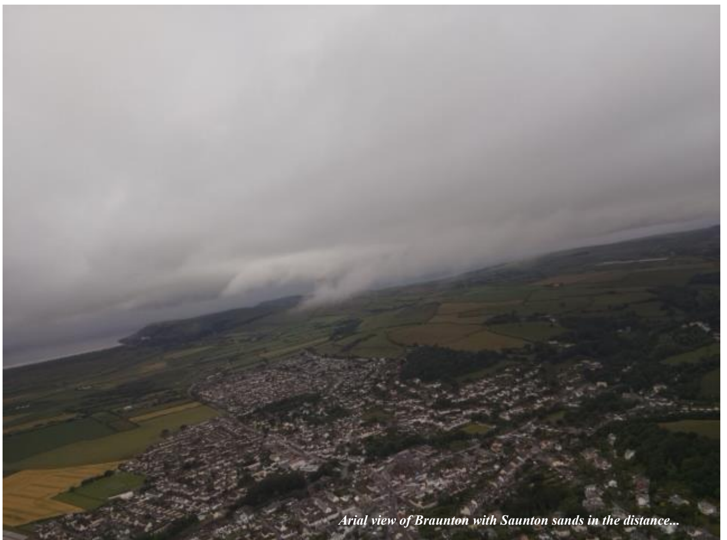
Aerial view of Braunton with Saunton sands in the distance...