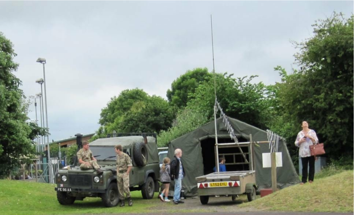
Royal Marines from Chivenor supporting the project with tracking and command facilities..